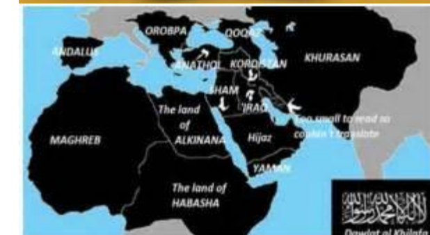
Supposed Future Islamic State?